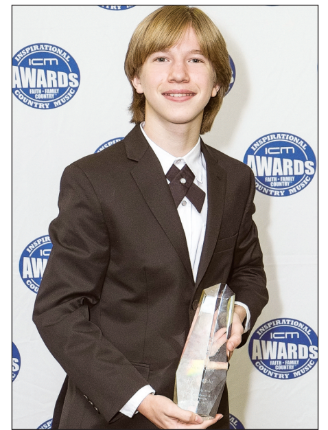
2014 ICM Awards <sup>®</sup>backstage